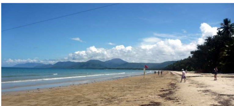
Photo: Four Mile Beach, Port Douglas

After following (mostly) sealed roads into Port Douglas, the race leads onto the southern end of Four Mile Beach . One of the many attractions of Port Douglas this fine hard beach is considered to be one of the best in far north Queensland. The sand is so firm that the beach has been used for horse races and mountain bike races and also as a landing place by Kingsford Smith and by C.T.P. Ulm en route to New Guinea with the first official air mail.