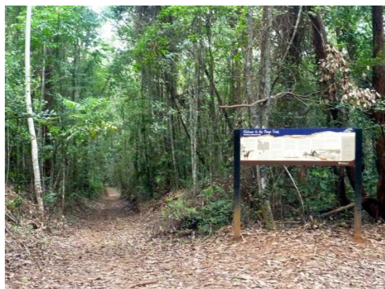
Photo: Start of the Bump Track